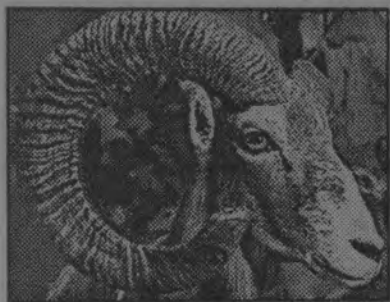
SILVER-MEDAL KILL: Before running into Jones, this Mouflon sheep lived in Bulgaria.

In another room, guarding French doors to a swimming pool, are two 18-foot male giraffes, one from South Africa, the other from Zimbabwe. A white sable rhino, as big as a Toyota, is parked in a corner, overshadowed by a Russian brown bear, standing eight feet high, and an Arctic musk ox.